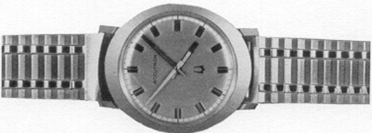
21080-7W ACCUTRON "253" White, electronic timepiece, stainless steel, water resistant. Sweep second hand, locking ring, swedged silver markers on silver dial. Adjustable stainless steel band with fold-over buckle. $125.00