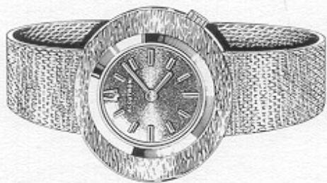
24400-4Y ACCUTRON "430" Yellow, electronic timepiece, 10K gold filled case with attached mesh textured bracelet. Applied markers on tangerine dial. Water resistant. ACCUTRON "431" Same as above with gilt dial. $185.00