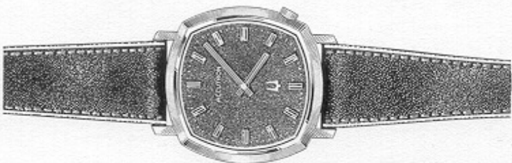
21401-5W ACCUTRON "260" White, electronic timepiece, satin finish stainless steel. Silver markers on charcoal grey matte dial. White insert on hands. Grey corfam strap with silver edge. $125.00