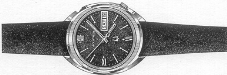
21500-4W ACCUTRON DATE AND DAY "Q" White, electronic timepiece, stainless steel. Water resistant, sweep second, day/date windows, blue dial, combination Roman numeral and stick markers, luminous dots and hands. Blue corfam strap. $175.00