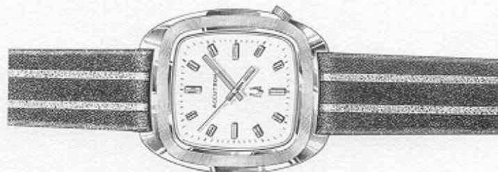
21111-0W ACCUTRON "263" White, combination brushed and polished stainless steel case, non water-resistant, sweep second hand. Silver applied markers with red inserts at 12, 9, 6 and 3, black inserts at other hour positions. Red inserts on hands. Sunray silver dial. Grey napped corfam strap with silver lame inserts. $125.00