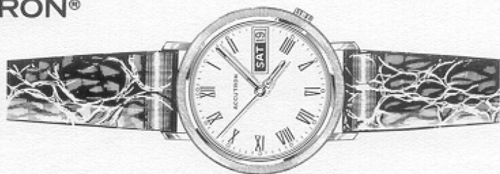
24503-5Y ACCUTRON DATE AND DAY "F" Yellow, 14K gold filled, sweep second, day/date window, applied full Roman numerals on silver dial, luminous dots and hands. Resistant to common watch hazards. Russet strap. $195.00