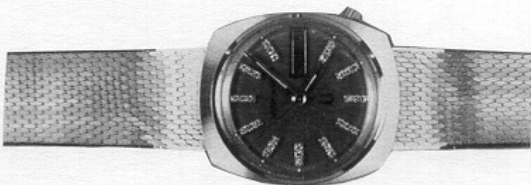
25516-6Y ACCUTRON DATE AND DAY "D-516" Yellow, 14K solid gold brushed finish case with attached 14K solid gold mesh band. Dial has indexes with 3 diamonds each at 11 hour positions with the day/date at the 3 hour position. Yellow sweep second, grey background dial. $900.00