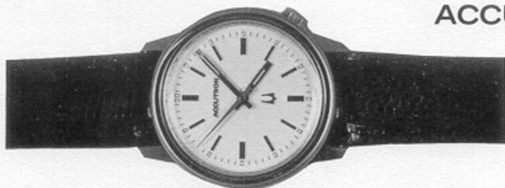
21107-8W ACCUTRON "259" White, satin finish stainless steel. Water resistant. Black insert on hands, red sweep second, black top markers on a silver dial. Black lizard strap. $110.00