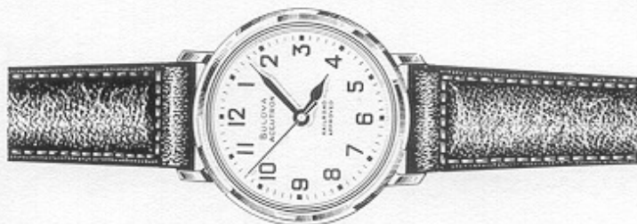
21083-1W ACCUTRON "262" White, electronic timepiece, stainless steel, water resistant. Sweep second, 12-hour dial, Railroad approved. Black calf strap. 24080-4Y ACCUTRON "435" Same as above in yellow, 10K rolled gold plate with black grain corfam strap. $125.00