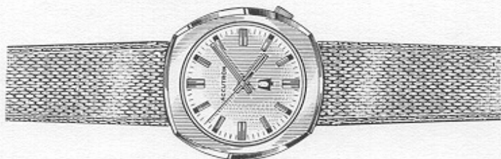
24100-0Y ACCUTRON "101" Yellow, electronic timepiece, 10K gold filled case with attached 10K gold-filled band. Water resistant, sweep second hand, brass applied markers on gilt dial. $185.00