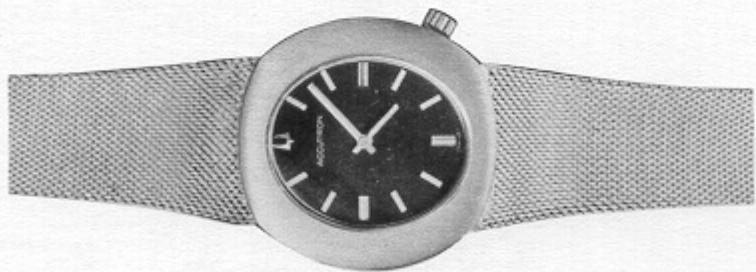
24405-3Y ACCUTRON "433" Yellow, electronic timepiece, 14K gold-filled case with soldered 1/10th 14K gold-filled bracelet. Applied gilt markers on orange dial. $200.00