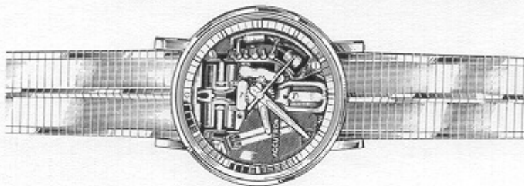
24076-2Y ACCUTRON SPACEVIEW "S" Yellow, electronic timepiece, 10K gold filled top, stainless steel back, clear crystal dial with luminous hour indicators and hands, sweep second. Water resistant. Matching band with fold-over buckle. $150.00