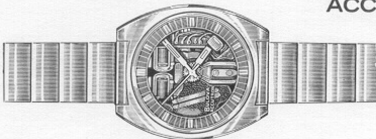
21077-3W ACCUTRON SPACEVIEW "T" White, electronic timepiece, stainless steel, water resistant. Clearview dial arrangement with luminous hands and markers, sweep second. Stainless steel band with fold-over buckle. $135.00