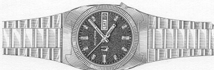
21513-7W/Y ACCUTRON DATE AND DAY "AH" Yellow/white, stainless steel case with gold-filled bezel ring, water resistant. Sweep second, day/date window, burgundy dial, luminous dots and hands. Combination stainless steel and gold-filled band. $195.00