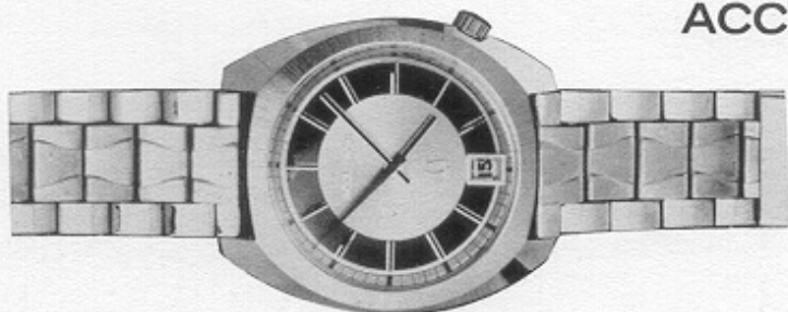
22305-7Y ACCUTRON CALENDAR "CO" Yellow, electronic timepiece, 40 micron bezel, rolled gold plate back, water resistant, steel locking ring. Sweep second hand, calendar window, brass applied markers on gilt dial with taupe inner panel. Gold filled bracelet. $185.00