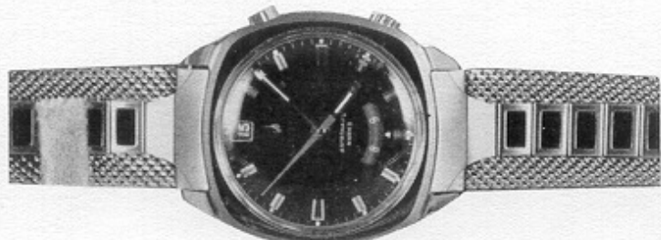
21602-8W ACCUTRON ASTRONAUT MARK II "E" White, electronic timepiece, stainless steel, water resistant. Calendar (super-navigator), luminous dots and hands, applied silver markers with red inserts on black dial. Stainless steel mesh band with black insert and fold-over buckle. $185.00