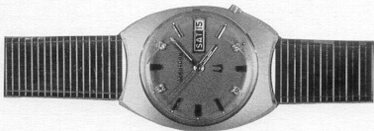
25517-4Y ACCUTRON DATE AND DAY "D-517" Yellow, brushed 14K solid gold case. 4 diamonds on dial at 1, 5, 7, and 11. Gilt markers on silver-grey dial, sweep second, luminous dots and hands. Gold-filled band with fold-over buckle. $325.00