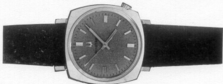
23152-2Y ACCUTRON "303" Yellow, electronic timepiece, 10K rolled gold plate, steel locking ring. Sweep second, applied markers on light grey dial. Brown sharkskin strap. $135.00