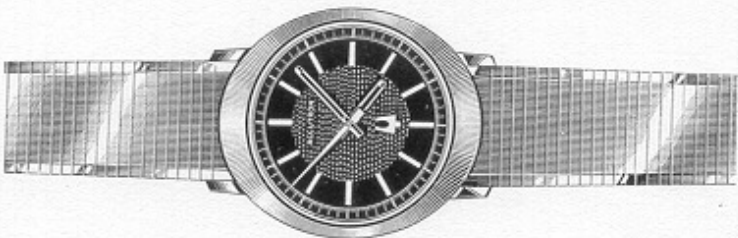
21078-1W ACCUTRON "250" White, electronic timepiece, stainless steel. Water resistant, sweep second hand, printed markers on blue dial. Stainless steel band with fold-over buckle. $125.00