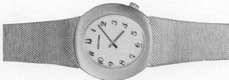
24406-1Y ACCUTRON "434" Yellow, electronic timepiece, 14K gold-filled case with soldered 1/10th 14K gold-filled bracelet. Printed numerals on white lacquer dial. $200.00