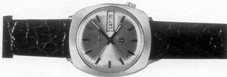
25520-8Y ACCUTRON DATE AND DAY "BA" Yellow, brushed 14K solid gold case. Water resistant. Day/date window, black sweep second, gilt markers outlined in black, luminous dots and hands, gilt sunray dial. Leather strap. $250.00