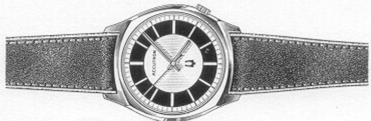
22102-8Y ACCUTRON "249" Yellow, electronic timepiece, 40 micron bezel, 10K rolled gold plate back, steel locking ring. Water resistant. White printed indexes on black transfer with gilt background dial. Napped brown corfam strap with gilt edge. $135.00