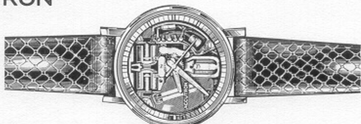
21036-9W ACCUTRON SPACEVIEW "G" White, stainless steel, clearview dial reveals the Accutron tuning fork movement. Sweep second, luminous hands and markers, protected against common watch hazards. Black python strap. $125.00