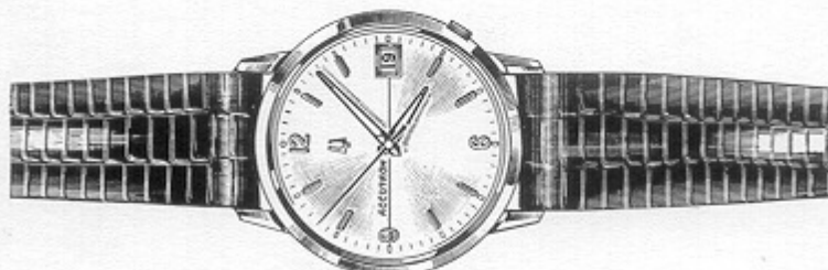
24300-6Y ACCUTRON CALENDAR "O" Yellow, 14K gold filled, sweep second, calendar window, applied numerals and sticks on silver dial, luminous dots and hands. Resistant to common watch hazards. Brown alligator lizard strap. $175.00