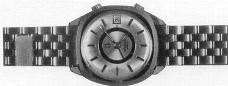
24602-5Y ACCUTRON ASTRONAUT MARK II "F" Yellow, electronic timepiece, 14K gold-filled case. Water resistant, sweep second, calendar (super-navigator), raised gold markers on silver dial, luminous dots and hands. Individually set local time zone hand. Gold-filled band with fold-over buckle. $200.00