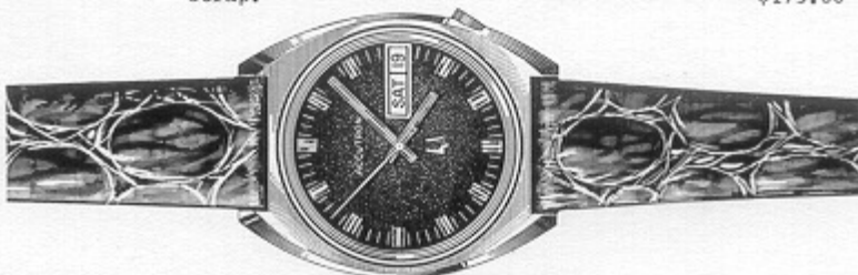
21524-4W ACCUTRON DATE AND DAY "AU" White, electronic timepiece, satin finish stainless steel case. Day/date window, sweep second, water resistant. Silver markers with black insert on burgundy red dial, lightening in tone toward the center. Black turtle strap. $175.00