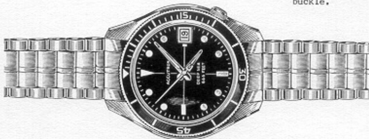
21350-4W ACCUTRON DEEP SEA White, stainless steel, water resistant to 666 feet and resistant to other common watch hazards. Calendar with magnifying bubble, recessed rotating plexi ring, sweep second. Black printed luminous marker dial, luminous hands. Stainless steel band with fold-over buckle. $195.00