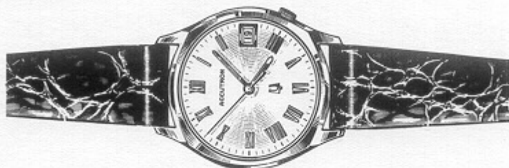
24321-2Y ACCUTRON CALENDAR "AF" Yellow, 14K gold filled, sweep second, calendar window, gilt applied Roman numerals on silver dial. Resistant to common watch hazards. Black alligator strap. $175.00