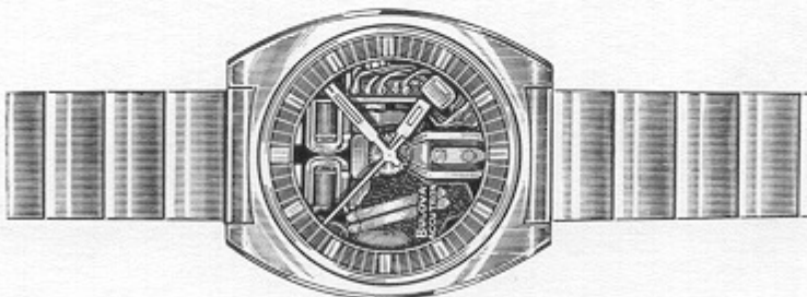
22010-3Y ACCUTRON SPACEVIEW "U" Yellow, electronic timepiece, stainless steel back. Water resistant, clearview dial reveals the tuning fork movement, luminous dots and hands. 10K gold-filled band with fold-over buckle. $150.00