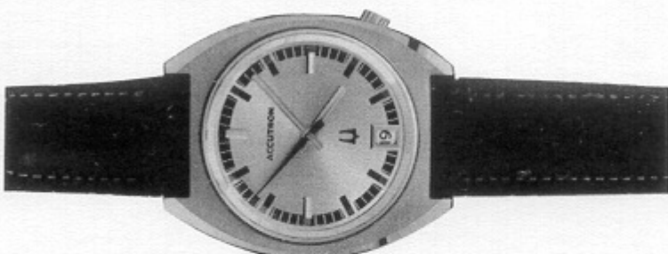
22304-0Y ACCUTRON CALENDAR "CN" Yellow, electronic timepiece, 40 micron bezel, rolled gold plate back, locking ring. Water resistant, date window, brass applied markers on gilt dial. Black strap with red stitching. $175.00