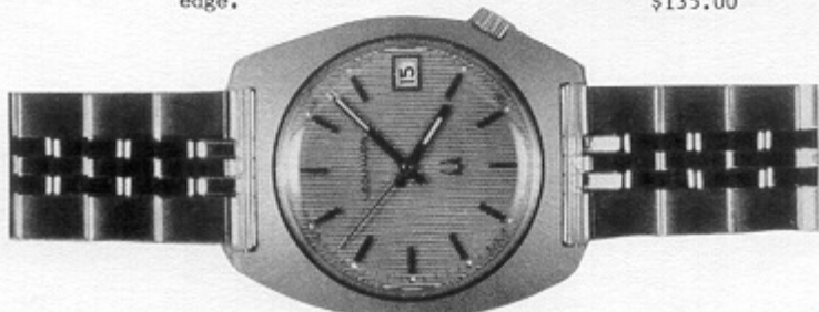
21339-7W ACCUTRON CALENDAR "CQ" White, brushed stainless steel. Water resistant. Black insert on hands, sweep second, applied silver markers with black insert on blue and white striped dial. Luminous dots and hands. Combination polished and brushed stainless steel band. $150.00