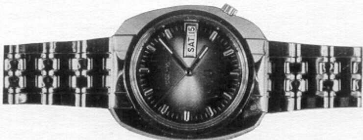
22505-2Y ACCUTRON DATE AND DAY "AY" Yellow, polished 40 micron top, stainless steel back. Water resistant. Day/date window, sweep second, luminous dots and hands, gilt applied markers on brown dial, shading to gold in center. 10K gold-filled polished band. $200.00