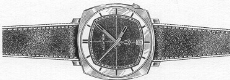
21332-2W ACCUTRON CALENDAR "CK" White, stainless steel, water resistant. Sweep second, calendar window, granite grey dial. Matching granite grey corfam strap with silver edge. $135.00