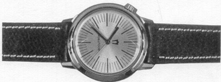
21110-2W ACCUTRON "257" White, polished stainless steel. Water resistant. Black printed markers on sunray silver dial, red sweep second. Grey calf strap with white stitching $115.00