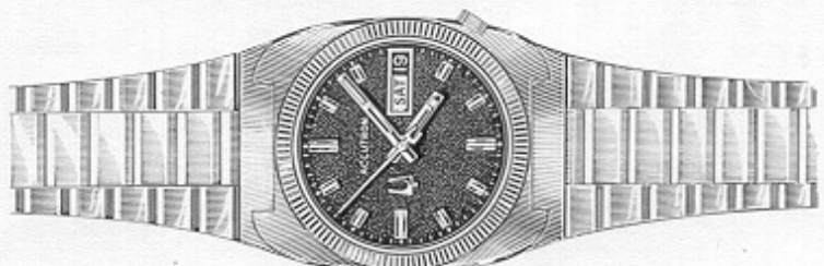
21513-7W/Y ACCUTRON DATE AND DAY "AH" Yellow/white, stainless steel case with gold-filled bezel ring, water resistant. Sweep second, day/date window, burgundy dial, luminous dots and hands. Combination stainless steel and gold-filled band. $195.