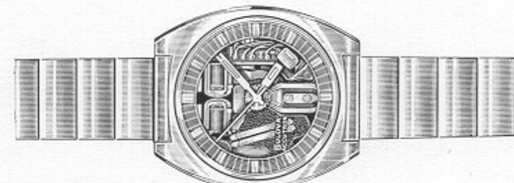
22010-3Y ACCUTRON SPACEVIEW "U" Yellow, stainless steel back. Water resistant, clearview dial reveals the tuning fork movement, luminous dots and hands. 10K gold-filled band with fold-over buckle. $150.