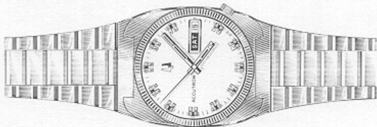
22500-3Y ACCUTRON DATE AND DAY "AK" Yellow, 40 micron bezel, 10K rolled gold plate back, 10K bezel ring. Steel locking ring, sweep second, day/date window, luminous dots and hands, brass applied markers on silver dial. 10K gold-filled band with fold-over buckle. $200.