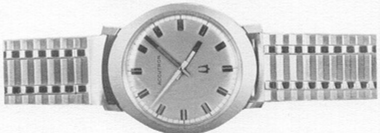
21080-7W ACCUTRON "253" White, stainless steel, water resistant. Sweep second hand, locking ring, swedged silver markers on silver dial. Adjustable stainless steel band with fold-over buckle. $125.