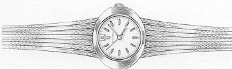
25807-9Y MINI ACCUTRON "G" Yellow, horizontal oval case of 14K solid gold with attached 14K solid gold linear-designed bracelet. Silver dial with orange luminous dots at hour positions, orange sweep second hand, calendar at 12 o'clock.