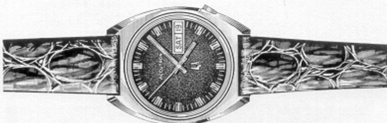
21524-4W ACCUTRON DATE AND DAY "AU" White, satin finish stainless steel case. Day/date window, sweep second, water resistant. Silver markers with black insert on burgundy red dial, lightening in tone toward the center. Black turtle strap. $175.