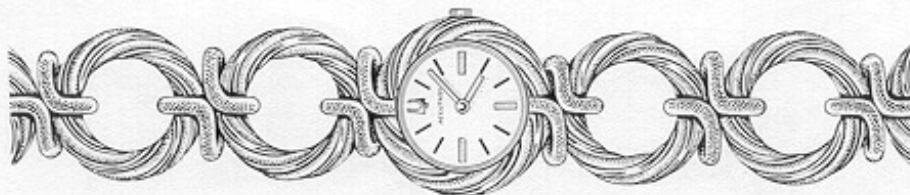
25808-7Y MINI ACCUTRON "H" Yellow, uniquely fashioned of 14K solid gold with hand-made, interwoven, multi-textured links forming both case and bracelet. Soft silver satin dial with gilt markers accented in charcoal gray. $1000.