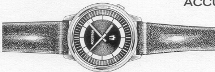
21104-5W ACCUTRON "258" White, satin finish stainless steel. White inserts on hands, white sweep second, white printed panel with blue lines under markers, sunray blue dial. Matching blue corfam strap. $110.