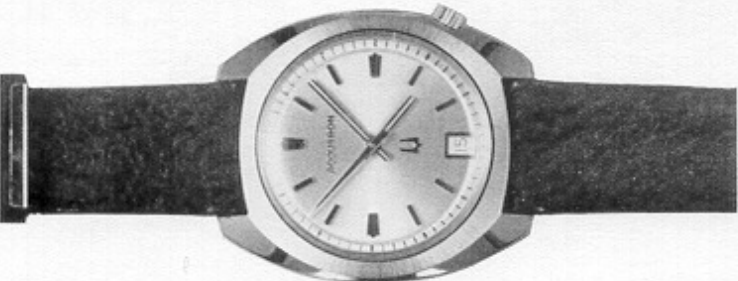
22306-5Y CALENDAR "CP" Yellow, combination polished and brushed 40 micron bezel with rolled gold plate back, water resistant. Calendar, sweep second, applied gilt markers, sun-ray silver dial. Brown sharkskin strap. $175.