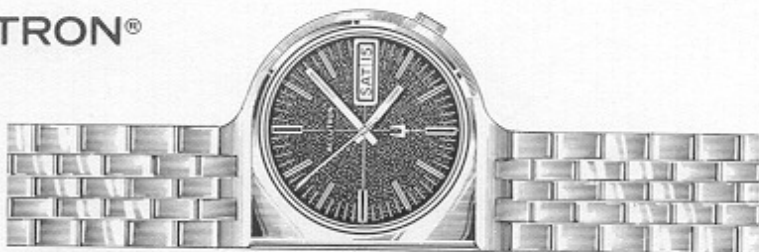
21519-4W DATE AND DAY "BD" White, stainless steel, water resistant. Sweep second hand, day/date, blue dial with applied silver markers with white painted lines, tritium at hour markers, white painted minute track, tritium hands. Adjustable integral link band with fold-over buckle. $185.