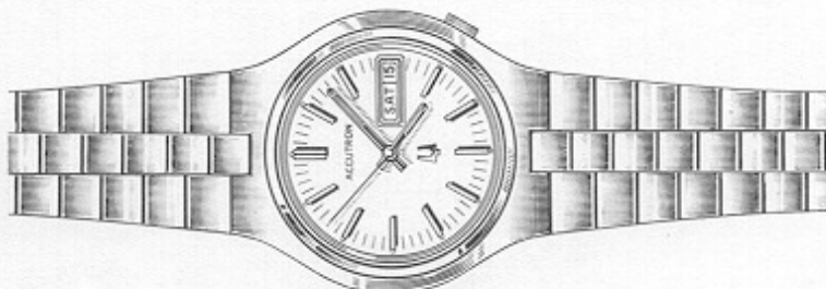
21518-6W ACCUTRON DATE AND DAY "BC" White, stainless steel, water resistant. Sweep second, day/date window, faceted silver baguette indexes, tritium at hour markers, tritium hands. Adjustable heavy link integral band with fold-over buckle. $185.