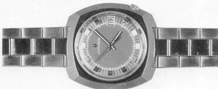
22307-3Y ACCUTRON CALENDAR "DA" Yellow, 40 micron top, rolled gold plate back, water resistant. Date, sweep second, taupe grey dial, bold faceted square markers, white minute track, tritium hands. Adjustable link band with fold-over buckle. $200.