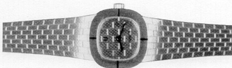
25805-3Y MINI ACCUTRON "E" Yellow, elongated satin-finish 14K solid gold case, 14K gold dial and attached 14K gold bracelet in matching brick pattern. $500.