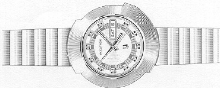
22503-7Y ACCUTRON DATE AND DAY "AW" Yellow, 40 micron bezel, stainless steel back. Sweep second, day/date window, locking ring, brass applied markers on gilt dial, water resistant. Gold-filled band with fold-over buckle. $225.