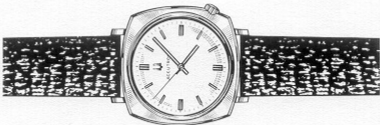
23152-2Y ACCUTRON "303" Yellow, textured and polished rolled gold plate case. Applied gold markers on slate grey dial, sweep second. Brown sharkskin strap. $135.