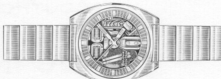
21077-3W ACCUTRON SPACEVIEW "I" White, stainless steel, water resistant. Clearview dial arrangement with luminous hands and markers, sweep second. Stainless steel band with fold-over buckle. $135.