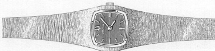
25806-1Y MINI ACCUTRON "F" Yellow, 14K solid gold case and bracelet in bark-textured finish. Pale green lacquer dial with gilt and white hour markers and gilt hands. $500.