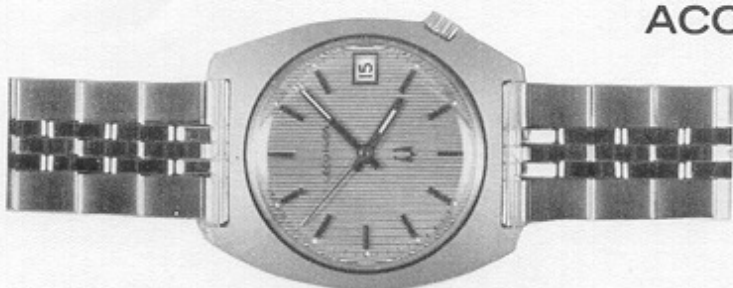
21339-7W ACCUTRON CALENDAR "CQ" White, brushed stainless steel. Water resistant. Black insert on hands, sweep second, applied silver markers with black insert on blue and white striped dial. Luminous dots and hands. Combination polished and brushed stainless steel band. $150.