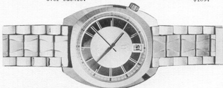
22305-7Y ACCUTRON CALENDAR "CO" Yellow, 40 micron bezel, rolled gold plate back, water resistant, steel locking ring. Sweep second hand, calendar window, brass applied markers on gilt dial with taupe inner panel. Gold filled bracelet. $185.