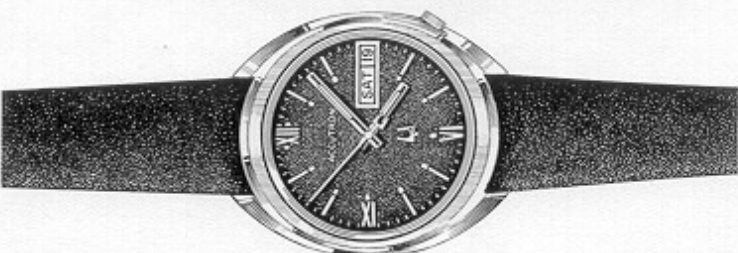
21500-4W ACCUTRON DATE AND DAY "Q" White, stainless steel. Water resistant, sweep second, day/date window, blue dial, combination Roman numeral and stick markers, luminous dots and hands. Blue corfam strap. $175.