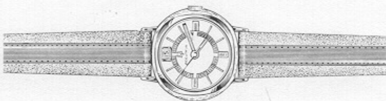
25816-0Y MINI ACCUTRON "Q" Yellow, brush textured case of 14K solid gold with bright contrast zone. Smoke crystal dial with turquoise zoned track, orange and gilt markers, calendar at 12 o'clock, gilt sweep second, gilt and orange hands. Napped and smooth applied taupe strap with gold-filled buckle. $275.