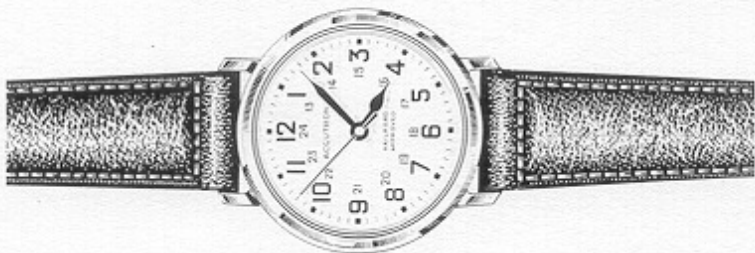
24049-9Y ACCUTRON "427" Yellow, 10K rolled gold plate, stainless steel back, water resistant. Sweep second, 24-hour dial, Railroad Approved. Black grain corfam strap. 21052-6W ACCUTRON "226" Same as above in stainless steel. $125.