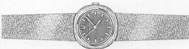
25804-6W MINI ACCUTRON "D" White, cushion-shaped 14K solid gold case textured to match 14K solid gold bracelet. Soft gray matte dial, silver and white markers, yellow sweep second hand. $475.