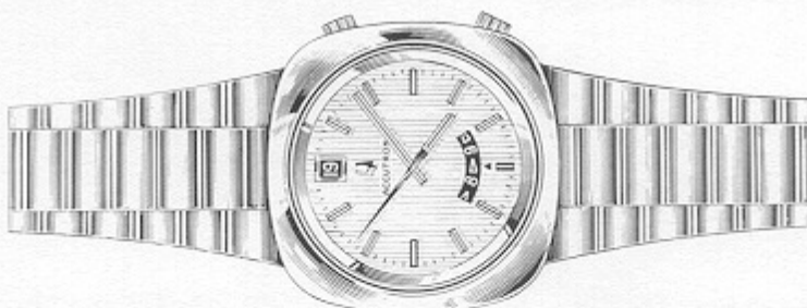
22600-1Y ACCUTRON ASTRONAUT MARK II "J" Yellow, 40 micron bezel, 10K rolled gold plate back, steel locking ring. Calendar window, individually set local time zone hand, base time "read-out" indicator, hand applied markers with black inserts on silver dial. Gold-filled tapered link band with fold-over buckle. $210.