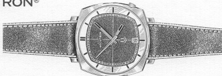
21332-2W ACCUTRON CALENDAR "CK" White, stainless steel, water resistant. Sweep second, calendar window, granite grey dial. Matching granite grey corfam strap with silver edge. $135.