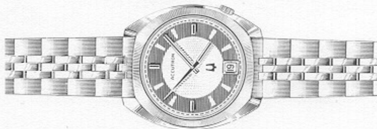
21333-0W ACCUTRON CALENDAR "CM" White, stainless steel, water resistant. Locking ring, sweep second hand, applied markers on silver dial, calendar window. Stainless steel link band with fold-over buckle. $135.