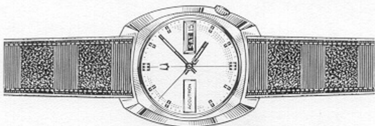
22502-9Y ACCUTRON DATE AND DAY "AV" Yellow, polished 10K gold-filled case. Day/date window, sweep second, gilt markers with black tops on horizontal grain gilt dial. Black insert on hands, thin black line from 12 to 6 o'clock. Brown striped strap of alternating smooth and napped corfam. $195.