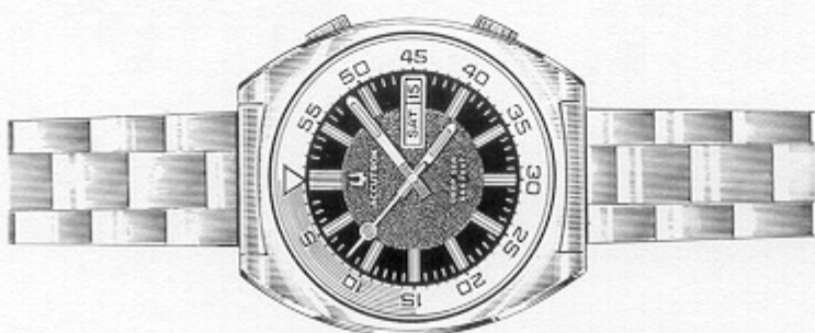
21510-3W ACCUTRON DEEP SEA "A" White, stainless steel, skindiver model, water resistant to 666 feet. Sweep second, day/date window, 2 setting crowns inside turning ring, luminous markers and hands, grey dial. Stainless steel band with fold-over buckle. Stainless steel band with fold-over buckle. $195.