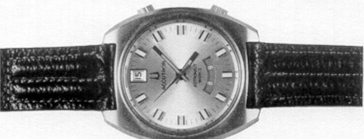
21603-6W ACCUTRON ASTRONAUT MARK II "G" White, stainless steel, water resistant. Calendar, individually set local time zone hand, base time "read-out" indicator, black edged white block hour markers, red sweep second, silver dial. Red-stitched black leather strap. $175.