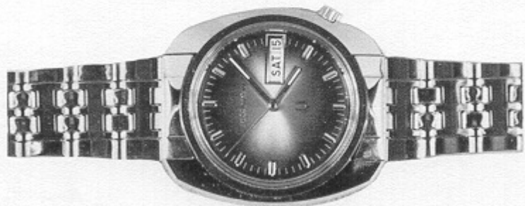
22505-2Y ACCUTRON DATE AND DAY "AY" Yellow, polished 40 micron top, stainless steel back. Water resistant. Day/date window, sweep second, luminous dots and hands, gilt applied markers on brown dial, shading to gold in center. 10K gold-filled polished band. $200.