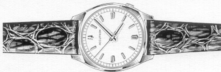
22107-7Y ACCUTRON "302" Yellow, 40 micron bezel, 10K rolled gold plate back, water resistant. Steel locking ring, sweep second hand, applied gold markers on silver dial. Brown leather strap. $135.