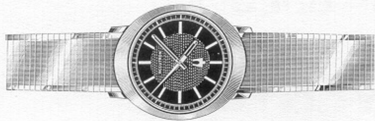
21078-1W ACCUTRON "250" White, stainless steel. Water resistant, sweep second hand, printed markers on blue dial. Stainless steel band with fold-over buckle. $125.