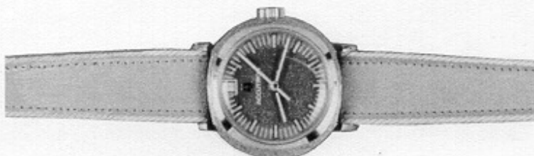
25815-2Y MINI ACCUTRON "P" Yellow, 14K solid gold case, smoke crystal dial, multi-faceted gilt markers, calendar window at 12 o'clock, orange sweep second, napped taupe corfam strap with white silk edge and gold-filled buckle. $275.