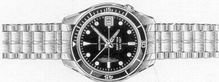
21350-4W ACCUTRON DEEP SEA White, stainless steel, water resistant to 666 feet and resistant to other common watch hazards. Calendar with magnifying bubble, recessed rotating plexi ring, sweep second. Black printed luminous marker dial, luminous hands. Stainless steel band with fold-over buckle. $195.