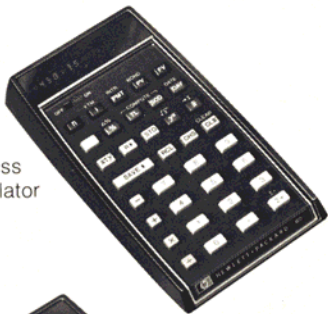
HP-80 Business Pocket Calculator