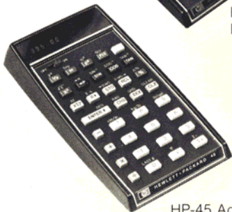
HP-45 Advanced Scientific Pocket Calculator