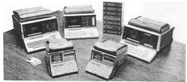
☆ = NEW ↓ HP 4951C HP 4952A ☆ HP 4954A HP 4955A ☆ HP 4972A

While maintaining family compatibility, each analyzer is tailored for a different environment, with different features and characteristics. All share common operating, setup, remote transfer and display characteristics. See the chart listed below for each analyzer's characteristics.